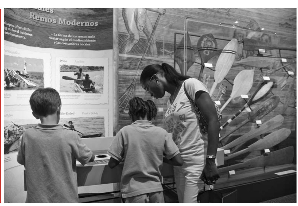
▲ First grade students from Littlewood Elementary School in Gainesville visit the dugout canoe exhibit at FLMNH.

ne of the Outreach Program's new initiatives funded by the Center's 2010-14 Title VI National Resource Center grant is expansion of our K-12 outreach efforts to the natural sciences. Proposed activities include offering summer institutes for science teachers, creating a science-themed traveling suitcase, increasing collaboration with the Florida Museum of Natural History, and partnering with the College of Education's (COE) UFTeach program. The goal of UFTeach is to increase the quantity and quality of secondary mathematics and science teachers.