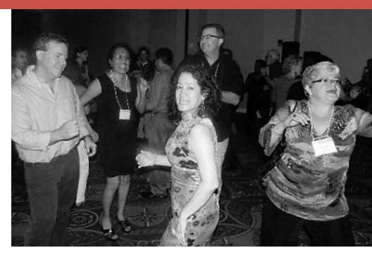
▲ Dancing the night away at the SECOLAS banquet.