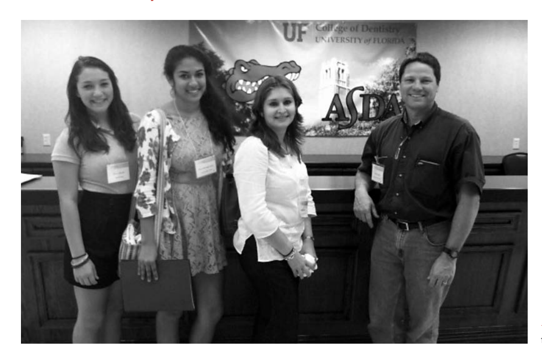
Local high school students and teachers attended the conference