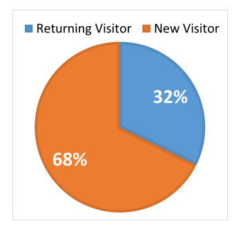
NOBLE's website continues to attract new visitors