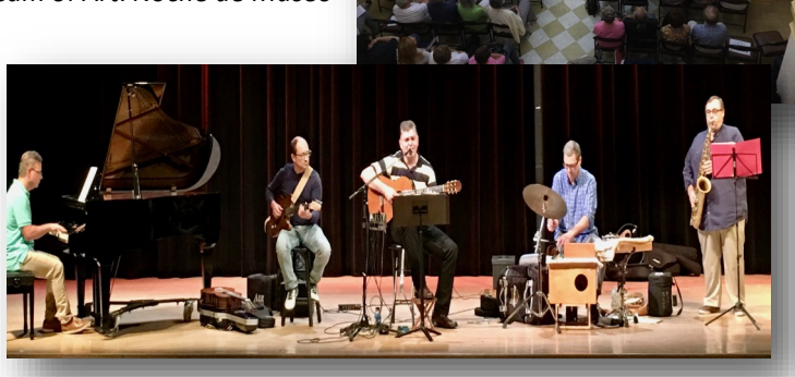
UF School of Music /LAS faculty Brazilian music performance